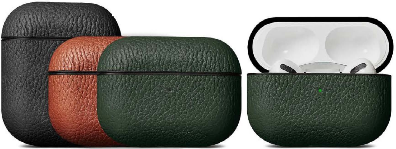
AirPods & AirPods Pro | Black | Cognac | Green