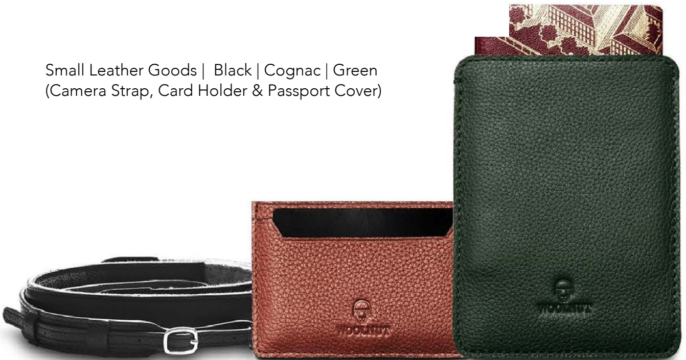
Small Leather Goods | Black | Cognac | Green (Camera Strap, Card Holder & Passport Cover)